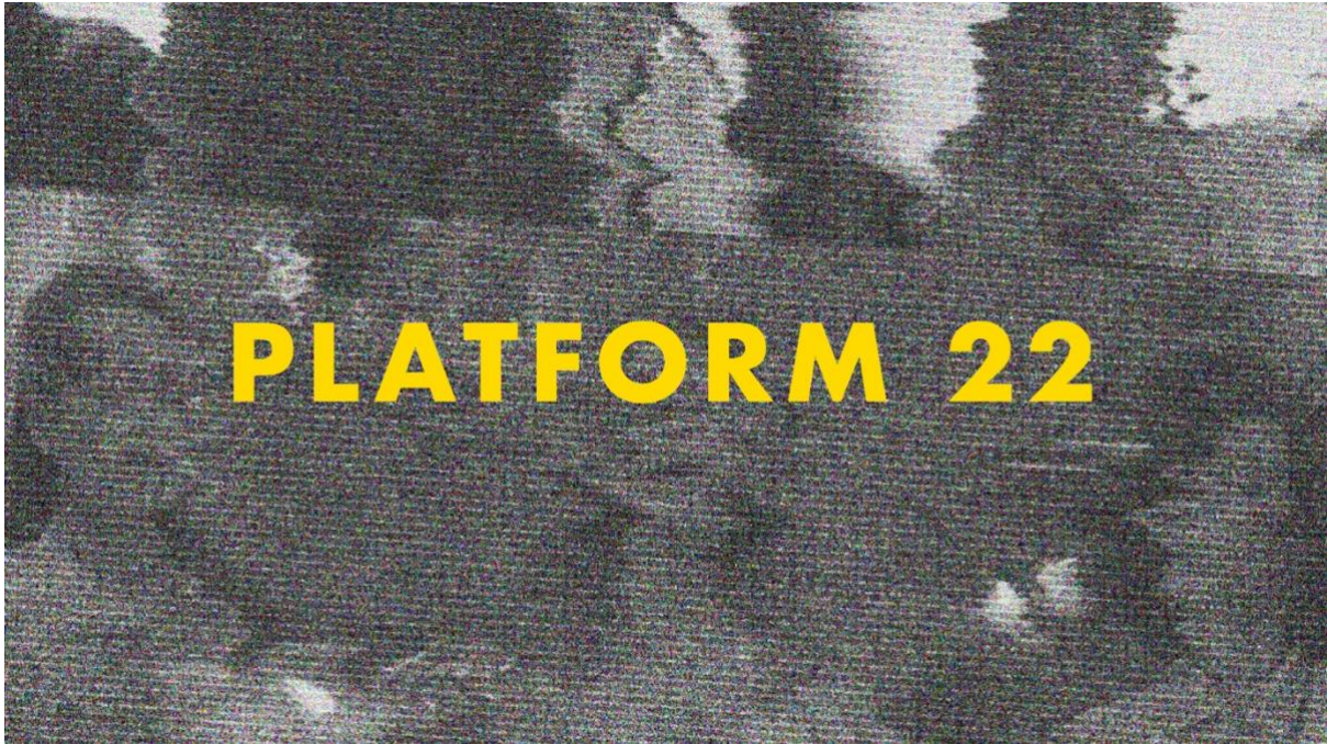
Image: Extract from Seance Sketch 1 (Can you hear me?) . Tyler Mellins, 2022.